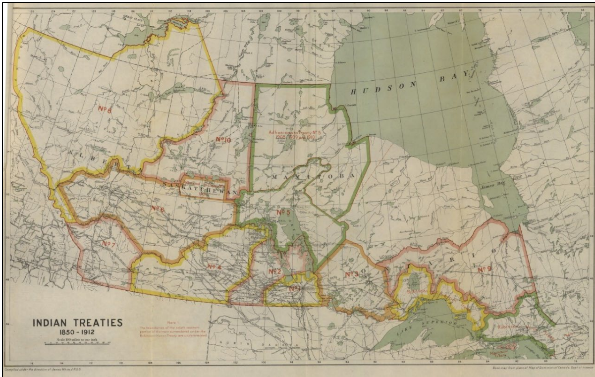
A 1913 map of Indigenous treaties across the prairies between 1850-1912, posted on March 9, 2026 at the Old Canda Series Facebook group.